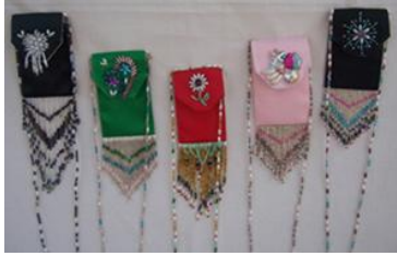
“Amulet Thimble Necklace