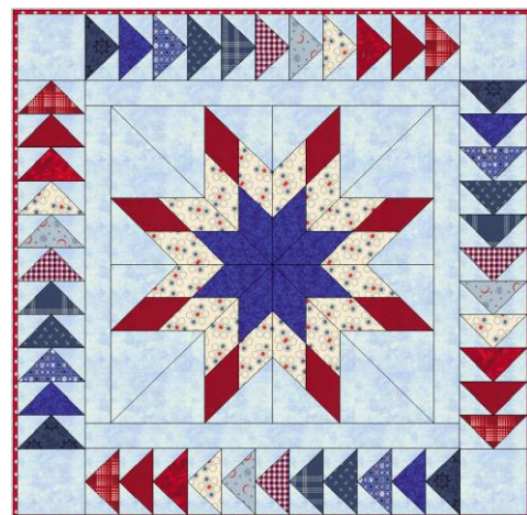
Quilt size as shown: 30" x 30"